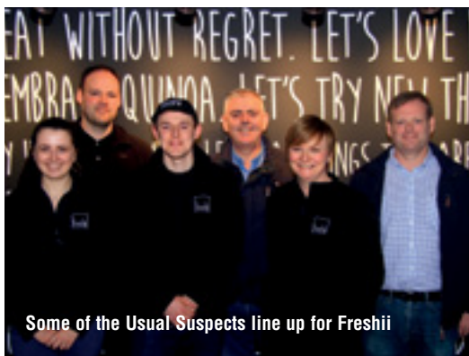
Some of the Usual Suspects line up for Freshii